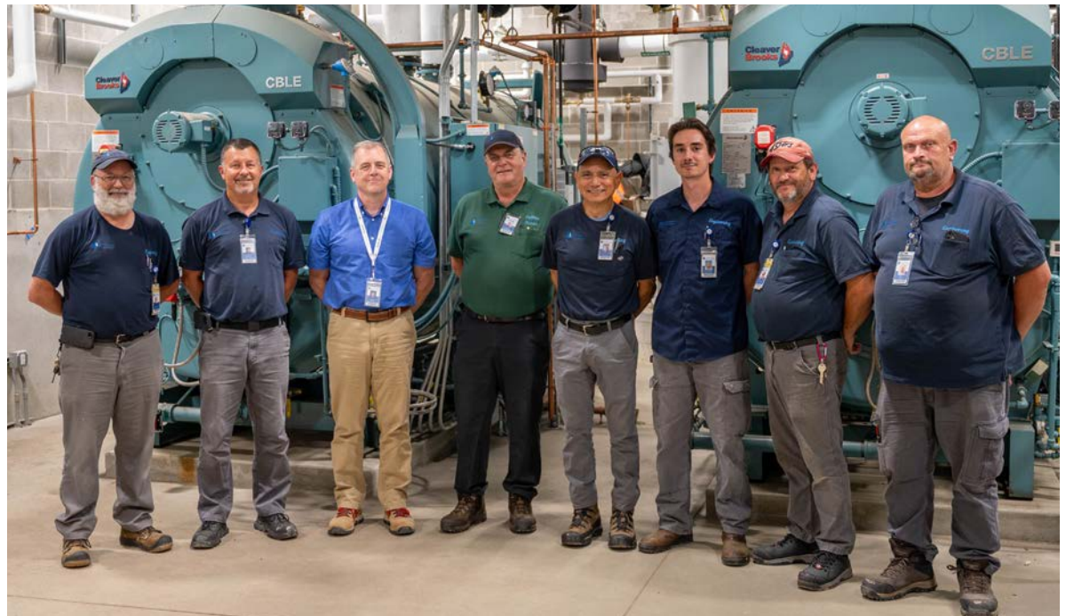
MDI Hospital's Engineering team celebrate the new sustainable, climate-resilient Central Utility Plant.

This transformational upgrade expands our capacity, reduces our carbon footprint, and decreases reliance on fossil fuels. With its completion in 2025, MDI Hospital has taken a bold step toward a greener, more resilient future, ensuring safe, reliable care for our community in every season, for generations to come.