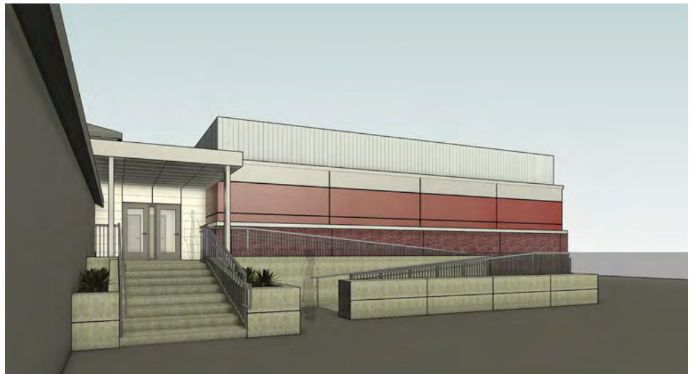
A rendering of what the outside of the building will look like upon completion of the new MRI system.