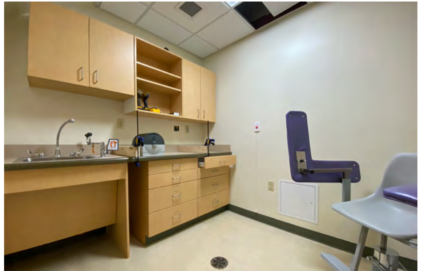
The completed renovations