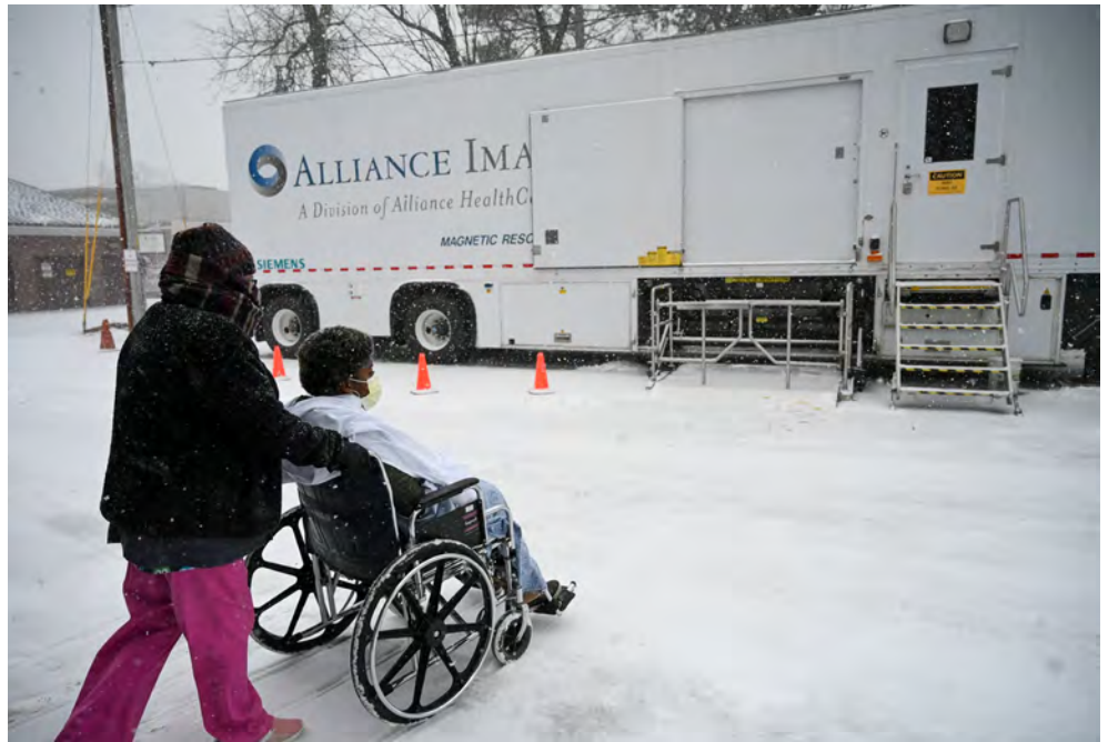
A patient is brought outside to the current mobile MRI trailer in MDI Hospital's parking lot