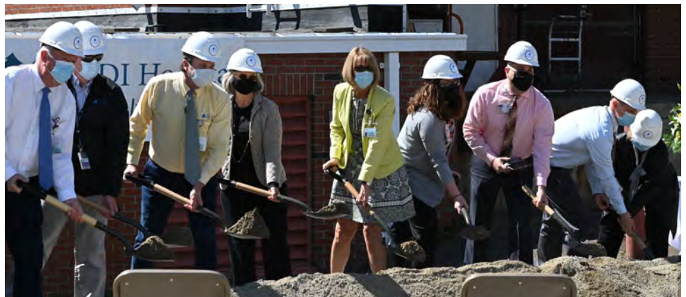
A groundbreaking ceremony was held on May 3, announcing the Hospital's first-ever fixed-place magnetic resonance imaging unit