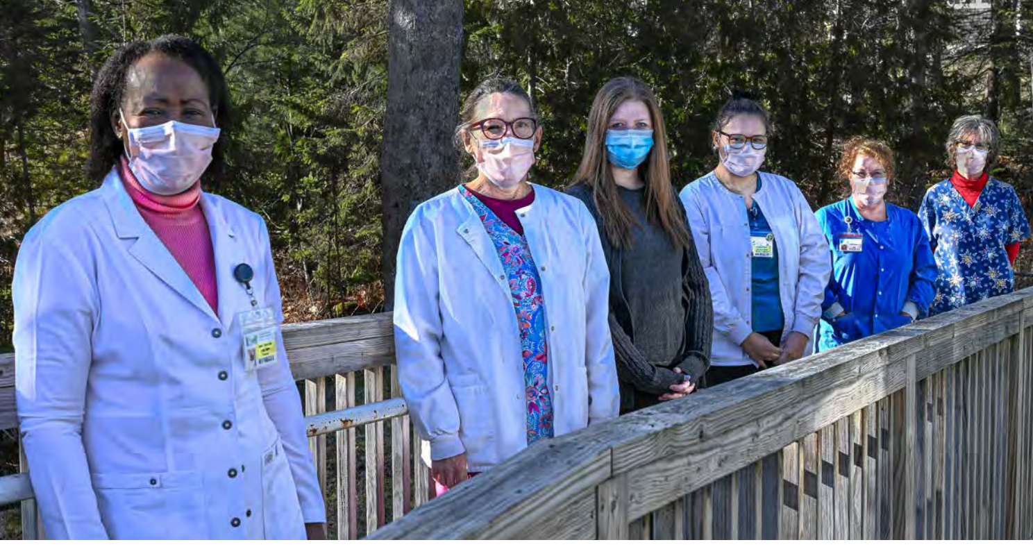
MDI Hospital's Community Dental Center Staff