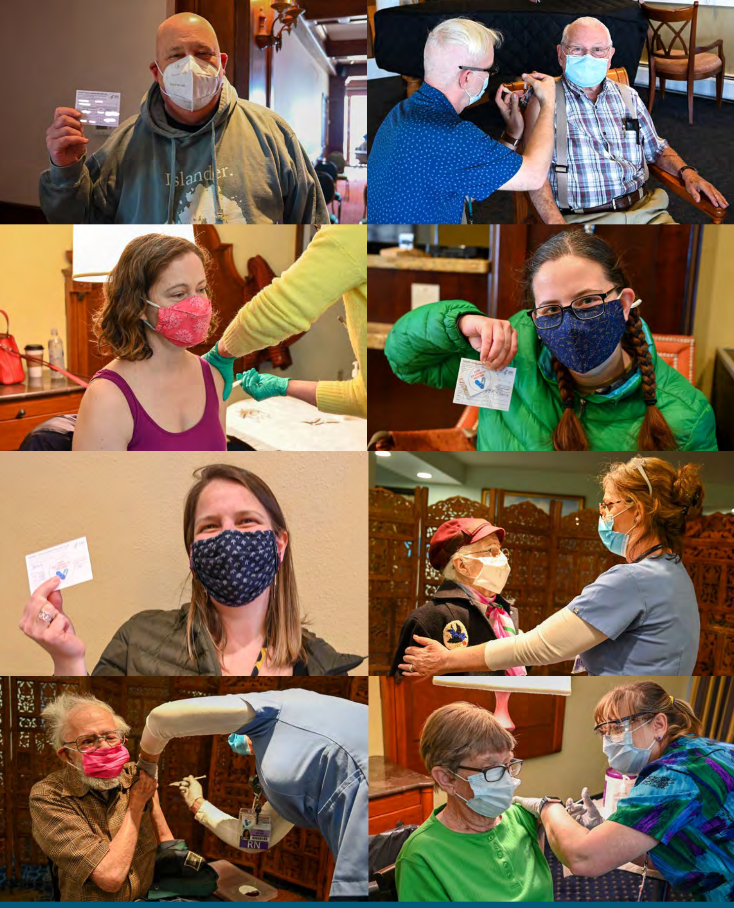
Above: Community members attend MDI Hospital's COVID-19 Vaccine Clinics Cover Photo: Local educators pose for a photo after receiving their COVID-19 vaccines