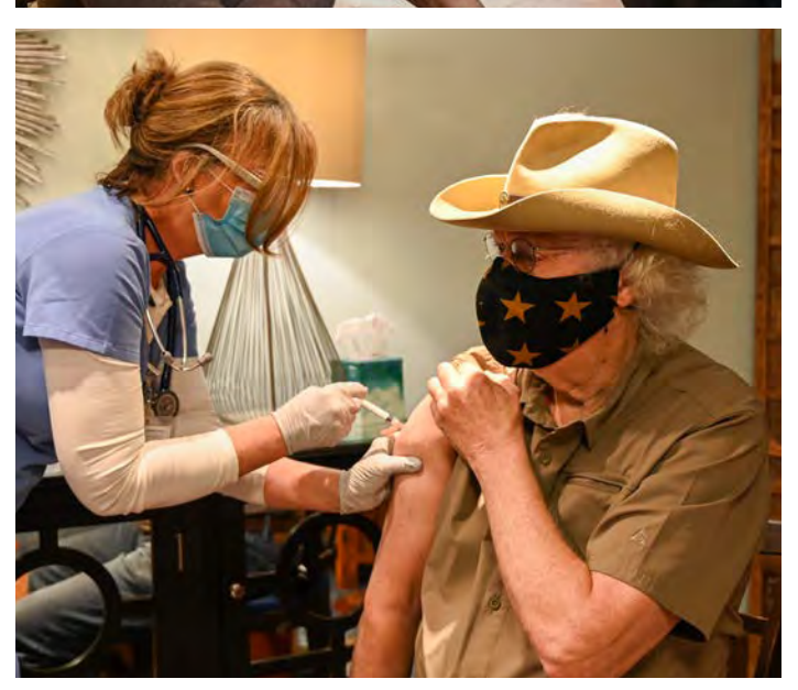
Above: Community members receive their vaccines at one of MDI Hospital's COVID-19 Vaccine Clinics

Left: Participants in MDI Hospital's Community Walking Program enjoy one of the many trails in Acadia National Park