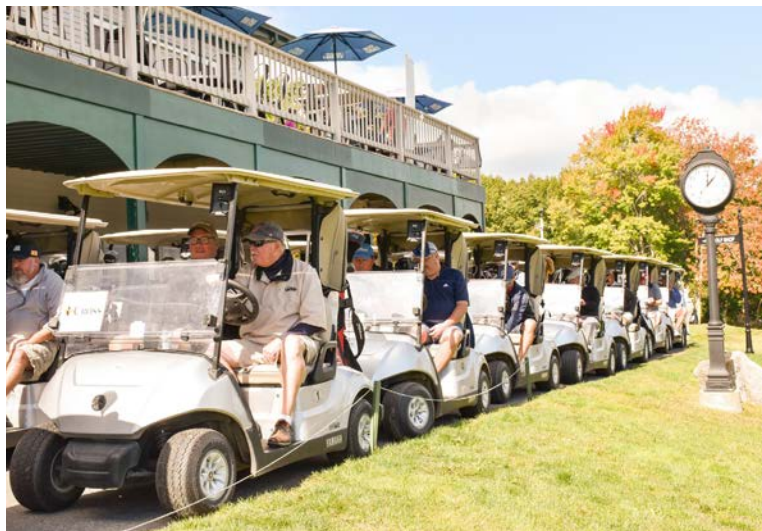
Golf carts line up at Kebo Valley Golf Club to begin the tournament

Thank you to all the sponsors, donors, and players who made this year's tournament a success!