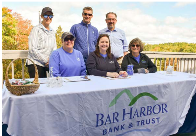
Bar Harbor Bank & Trust employees at the golf tournament registration table

Mount Desert Island Hospital has announced that the 29 th Annual David R. Harding Memorial Golf Tournament sponsored by Bar Harbor Bank & Trust raised $31,625 in support of the hospital's mission to provide access to high-quality, compassionate healthcare. More than 90 golfers participated in the golf tournament, which took place September 29 at Kebo Valley Golf Club in Bar Harbor.