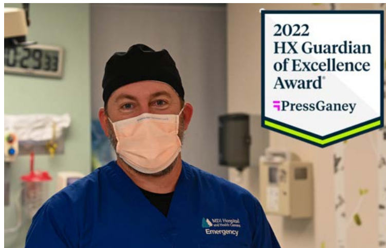
Mount Desert Island Hospital is recognized as a leader in the healthcare industry with the Press Ganey 2022 Human Experience (HX) Guardian of Excellence Award®